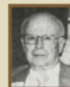
ELA Man of the Year

His greatest memory was when he headed the Electric League of Arizona's division of Manufacturer's Representatives and was very actively involved.